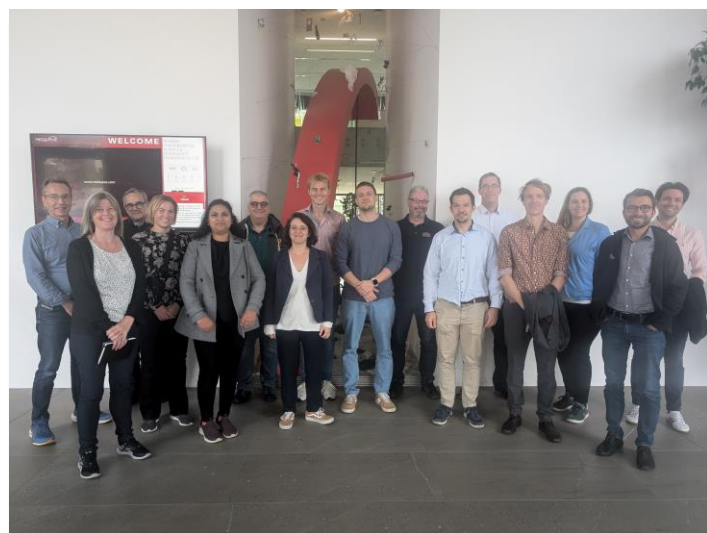
Fig.2: PURESCRAP consortium at Redwave