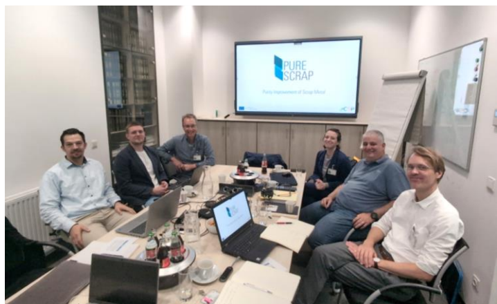
Fig.1: Work package leaders at the 1 st review meeting, September 2024

In September 2024, the PURESCRAP project held its first review meeting in Leoben, Austria, marking a milestone in our project. During the meeting, each work package leader presented the progress and achievements of the project's first 18 months to the project officer and the assigned reviewer. The presentations highlighted the developments and underlined the efforts of each project partner. Both, the project officer, and the reviewer expressed their interest in the results and provided valuable feedback for the next steps.