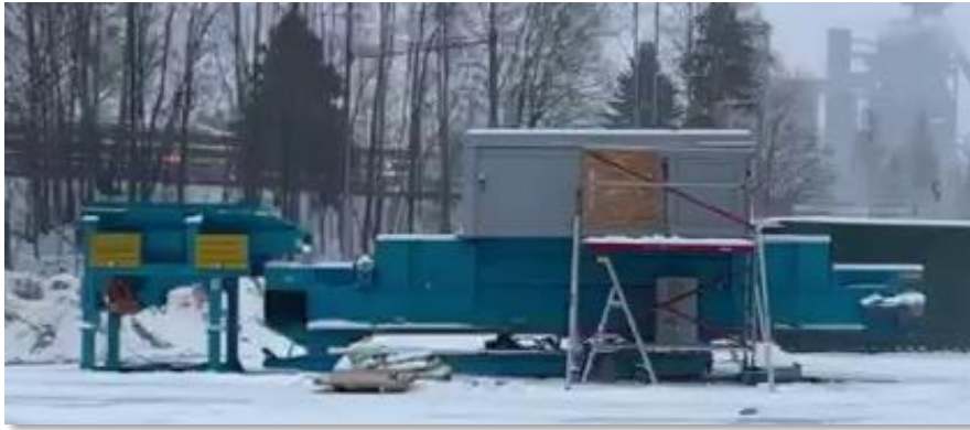
Fig.3: Test station for heavy (cut) scrap. Grey box is the sensor module

The work with sensor stations is progressing and we now have two sensor stations active, one for shredded and one for heavy (cut) scrap. The station for heavy scrap is currently located at Swerim demo plant in Luleå. It includes a feeder and conveyor for 1m sized samples. The vision unit (LiDAR + Camera) gives the material mass and provides coordinates where the chemical analysis of the LIBS sensor takes place. Analysing coated material is a challenge since the LIBS signals are obtained from the surface of the material. The LIBS sensor therefore includes a laser cleaning unit to remove surface layers. Rust is generally easy to remove but other surface coatings or layers present a greater challenge. Finding the best configuration for removal of coatings is one of the activities for the upcoming scrap processing campaigns. There is a trade off between having a powerful ablation and a tolerance for variation in sample position due to the uneven surface topography.